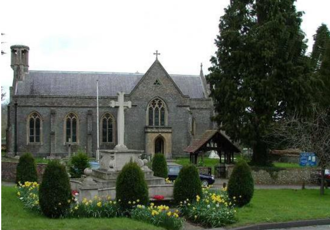
St. Matthew's Church Otterbourne